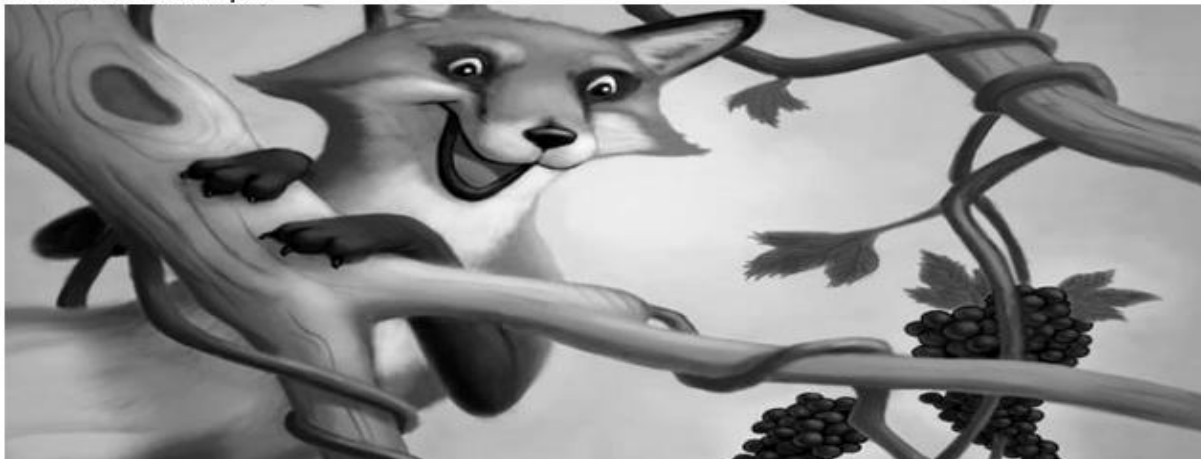
The Fox and the Grapes

One afternoon a fox was walking through the forest and spotted a bunch of grapes hanging from over a lofty branch.